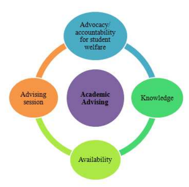
Figure 1. Spheres of Academic Advising

Although findings indicate gender may be a factor in achieving congruence between students' preferences and advisors' academic advising style, no research compared the advising practices of male advisors and female advisors from the perspectives of undergraduate students. Findings from this proposed study may contribute to an understanding of how students perceive male academic advisors and female advisors relative to the academic advising relationship according to four domains: the advising session, advocacy/accountability for student welfare, knowledge, and availability (Harrison, 2014).