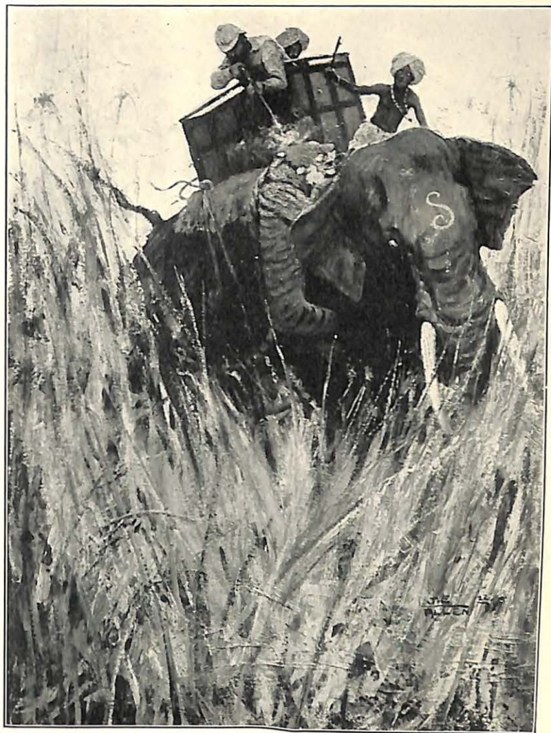
WITHOUT ANY WARNING THE MAGISTRATE FIRED

Seeing that the Englishman could do nothing and feeling sure that he would be killed, I knew I had to do something. I stopped swearing and with one terrible yell gave the elephant the master call. He went forward and put his trunk around a very thick