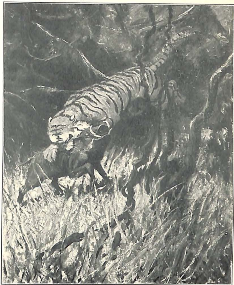
THE TIGER HAD FOUND HIS KILL

Suddenly, there was a bark followed by a deafening roar and then the thud of a leaping body falling on the ground. The tiger had found his kill. You know the tiger has three different calls—the hunger wail which is like a terrible sound cutting the jungle with hate;