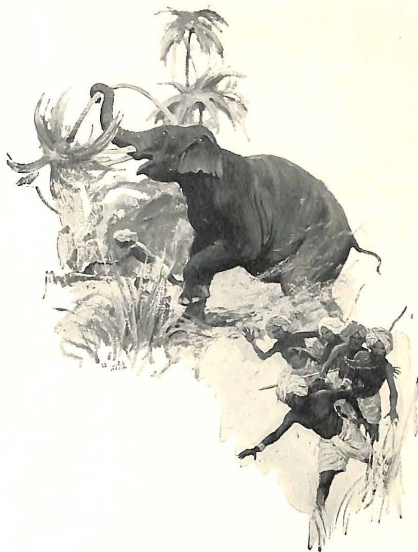
IN HIS MADNESS HE MUST HAVE GONE BACK TO THE JUNGLE

For a fortnight no one heard anything of him. I expected him to return to me, but he