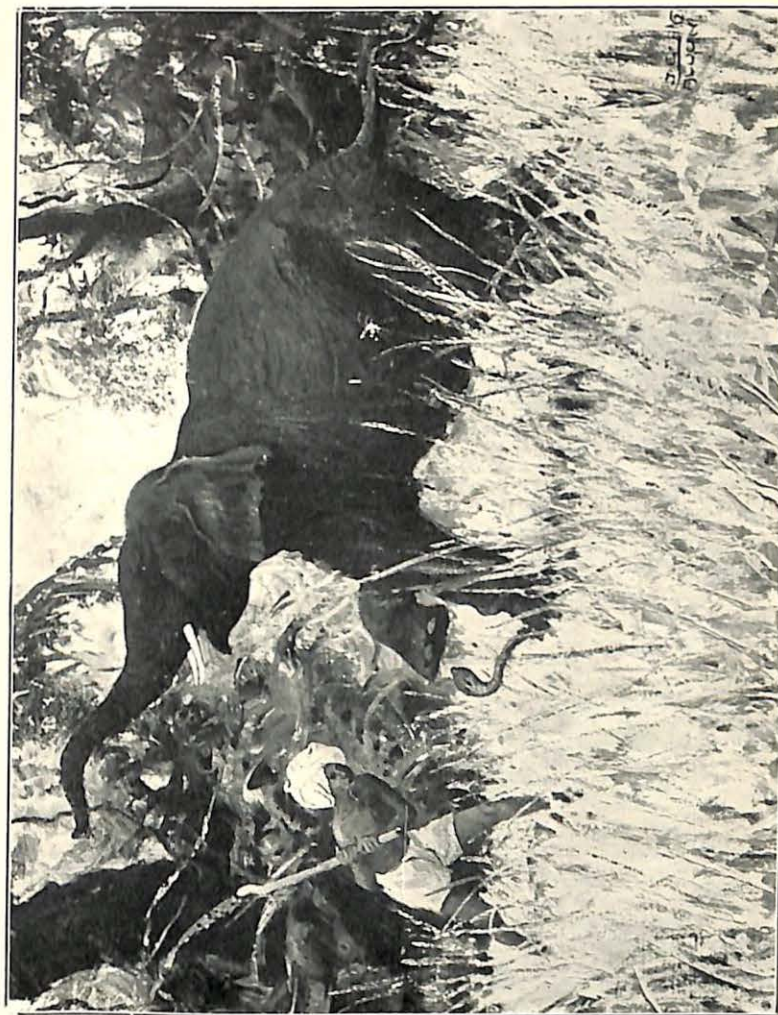
THAT VERY INSTANT THE UP-RAISED FOOT OF THE ELEPHANT WAS ON HIS HEAD

The sun was beginning to sink. The jungle