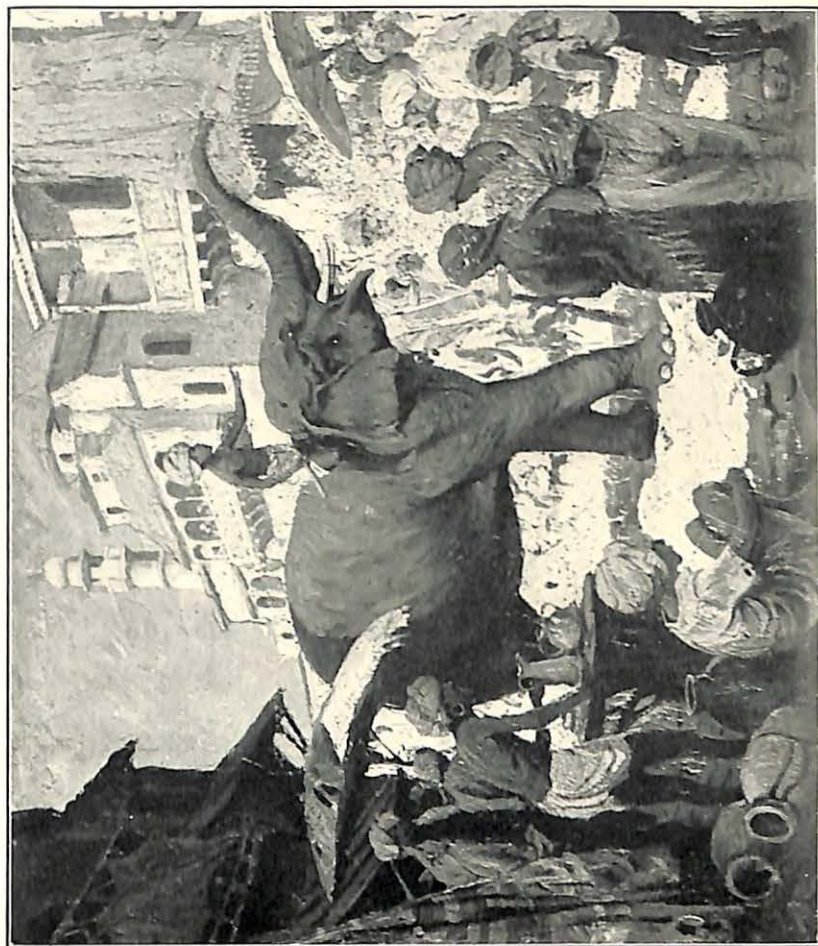
ONE DAY I TOOK THEM TO THE BAZAAR

One day I took them to the bazaar, I on the elephant and the monkey on my shoulder. When we had reached a mountain of mangoes round the corner of a lane, the monkey jumped off and climbed up to the top of the pile. At this the owner of the fruit chased him away, yelling and shouting. The monkey climbed up the roof of a house, followed by a crowd. Kari, however, put out his trunk and helped himself to whatever fruits he liked, eating them with great relish. The moment he heard the people coming back from the monkey chase, he ran away—and you may be surprised to know that when an elephant runs, he can go more than ten miles an hour. By the time we reached home, Kopee had buried his face in an enormous mango and was covered with the